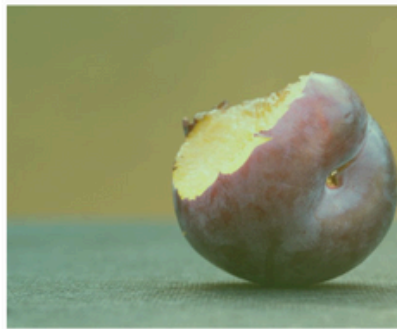
Line It Up

Our poetry-focused lesson plans and other educational resources are available on our website. Though our materials are sorted by age, they can be adapted and modified for all students.