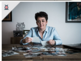
Bishop, "One Art" ELIZABETH BISHOP