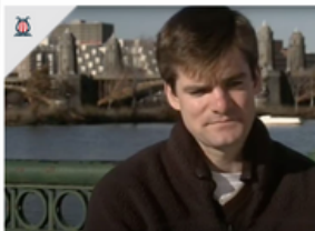
Boland, "The Emigrant Irish" EAVAN BOLAND