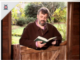
Bishop, "At the Fishhouses" ELIZABETH BISHOP

The Favorite Poem Project is moving! We will have a new home at the BU Center for the Humanities, where we will continue to champion poetry and public arts.